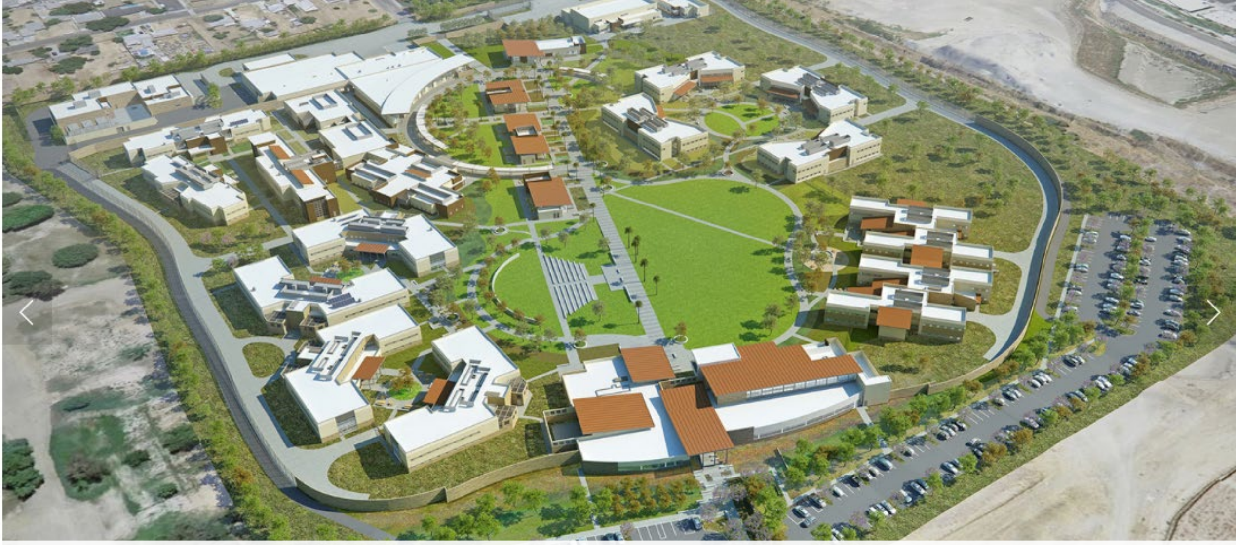
Las Colinas Women's Detention and Reentry Facility San Diego County, California