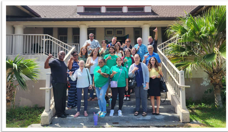
Group picture with Just Leadership USA and community members.